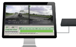
Review recordings directly from a removable cartridge