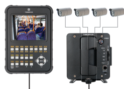
Live view using Reviewer or video out to monitor