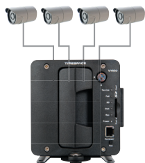
Stand alone recorder