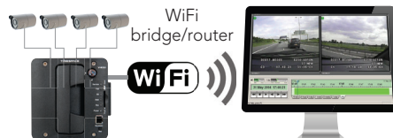
Multi-channel live view and wireless download of recordings